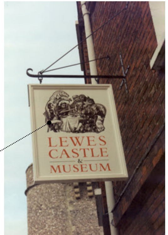
THE BARBICAN HOUSE MUSEUM AND CASTLE, LEWES