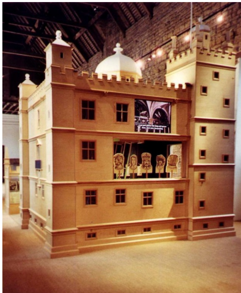
Windows of the walk-in model concealed many interactive's, a puppet theatre and an audio visual program for people who cannot access the castle.