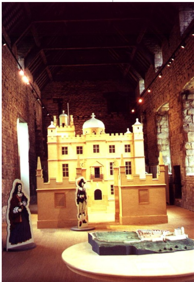
We concealed a highly interactive children's exhibition within a large model of Bolsover Little Castle.

Working for our long term client, English Heritage, we developed a number of new visitor experiences within a scheduled ancient monument. The scheme included a new visitor centre, site rebranding, a new audio tour trail, new interactive children's centre, and a number of site-wide audiovisual programs (by Centre Screen Ltd). We also thoroughly explored issues of access for visitors with sensory and mobility disabilities. We solved a number of complex visitor flow problems and developed memorable historical storylines.