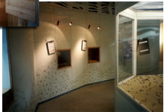
The locust run