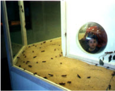
Locust enclosure with visitors able to get into the middle of it.