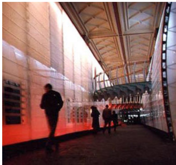
Main gallery vista