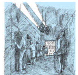
Explore the wreck