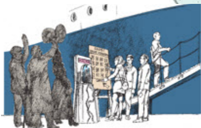
Boarding the Titanic