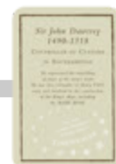
An example of how the lenticular graphics will change. Smaller versions of these lenticulars will be on sale in the shop.