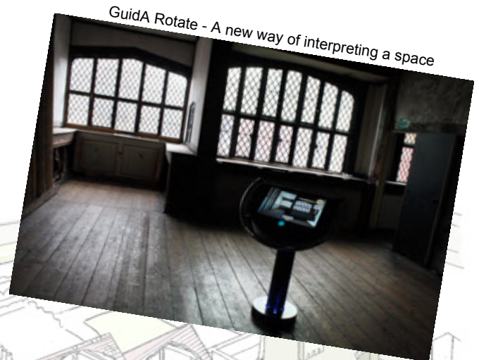
GuidA Rotate - A new way of interpreting a space