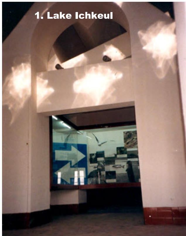
1. Lake Ichkeul

A design package including these models, enabled a local Tunisian workforce to build these visitor centres themselves